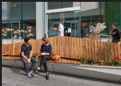
Ravine Bench by Gensler