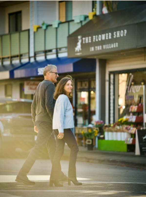
Steeped with charm, this community boasts wide, boulevard sidewalks adorned with open-air cafes and local shops, creating the ideal setting for a leisurely weekend stroll and a chance to catch up with friends from the neighbourhood.