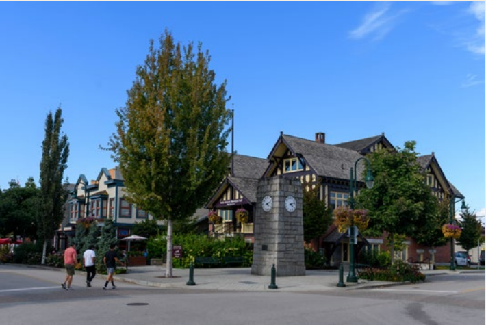
Ladner Village originated as a fishing community nestled along the banks of the Fraser River. Rich in character, history, and unmatched charm, the Village is full of hidden gems waiting to be discovered.