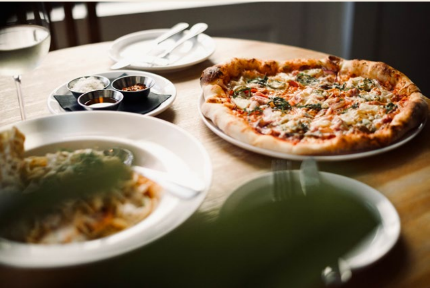
Within the Village, an abundance of culinary delights awaits. From the flavors of Italy to the tastes of Kyoto, a diverse array of local restaurants and bakeries pour their hearts into serving up homemade cuisines.