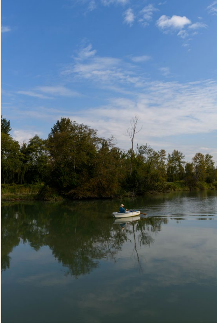
Embark on a tranquil paddle down the river and cast a line to fish, perpetuating the recreational legacy that the river has bestowed upon the village since its inception.