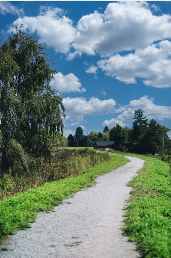
Nature envelops Bridge & Elliott, offering a tapestry of outdoor experiences. Explore the network of local parks, agricultural fields, and riverside trails on foot, by bike, or on a leisurely paddle down the river. The possibilities for outdoor adventure are boundless.