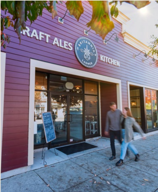
Grab a pint crafted by local breweries, where artisans meticulously hone their craft using the finest local ingredients. Gather with friends and savor the taste of good times.