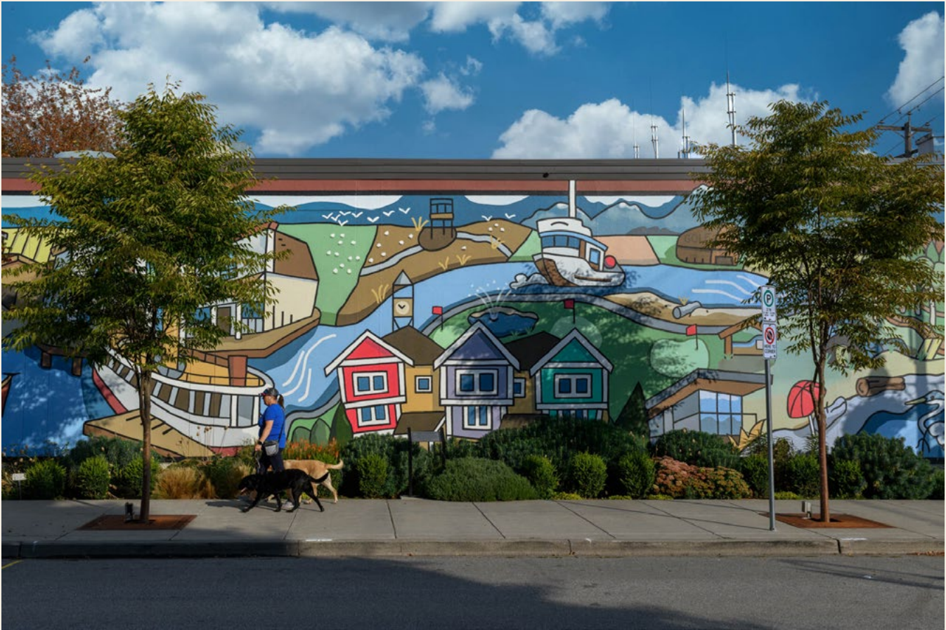
Ladner Village celebrates walkability, offering residents easy access to essential amenities within a 5-minute stroll from Bridge & Elliott. From grocery stores to bakeries, gift shops, and beyond, everything you need for daily life is conveniently located nearby.