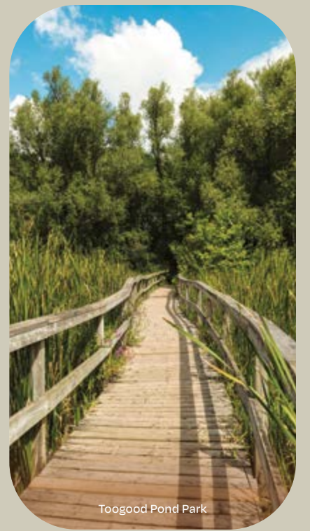
Toogood Pond Park