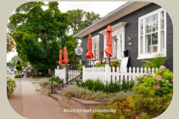
Main Street Unionville