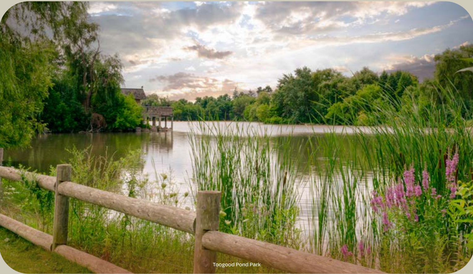
Toogood Pond Park