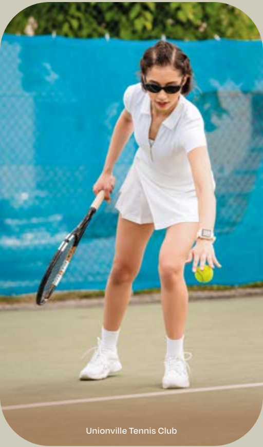
Unionville Tennis Club

4-minute drive 1 University Boulevard, Markham