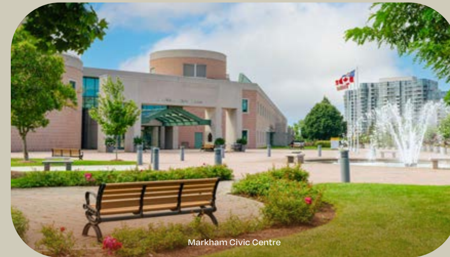
Markham Civic Centre