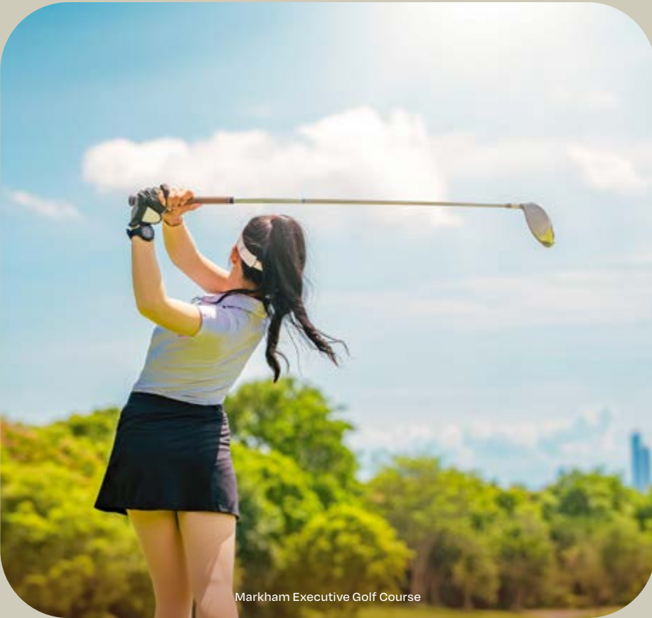
Markham Executive Golf Course