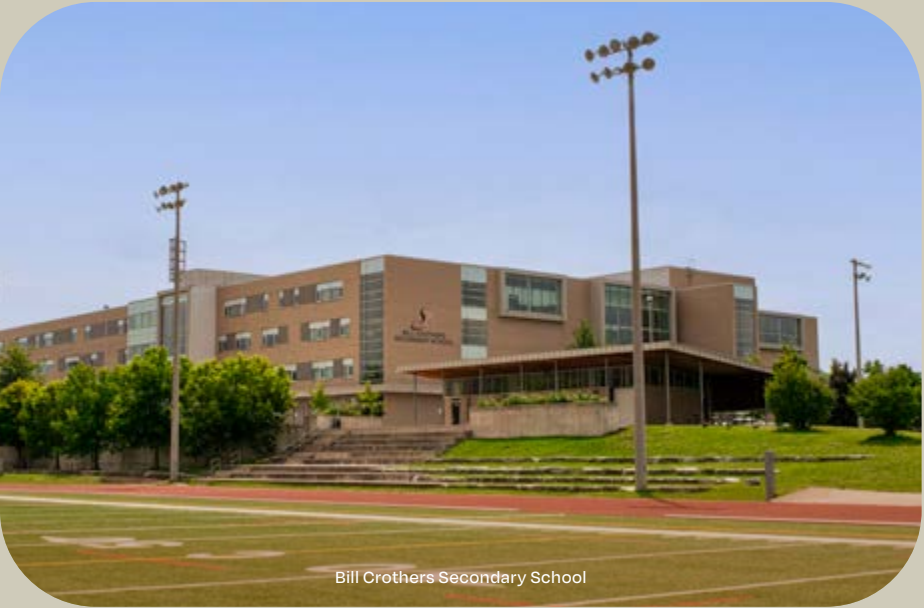
Bill Crothers Secondary School