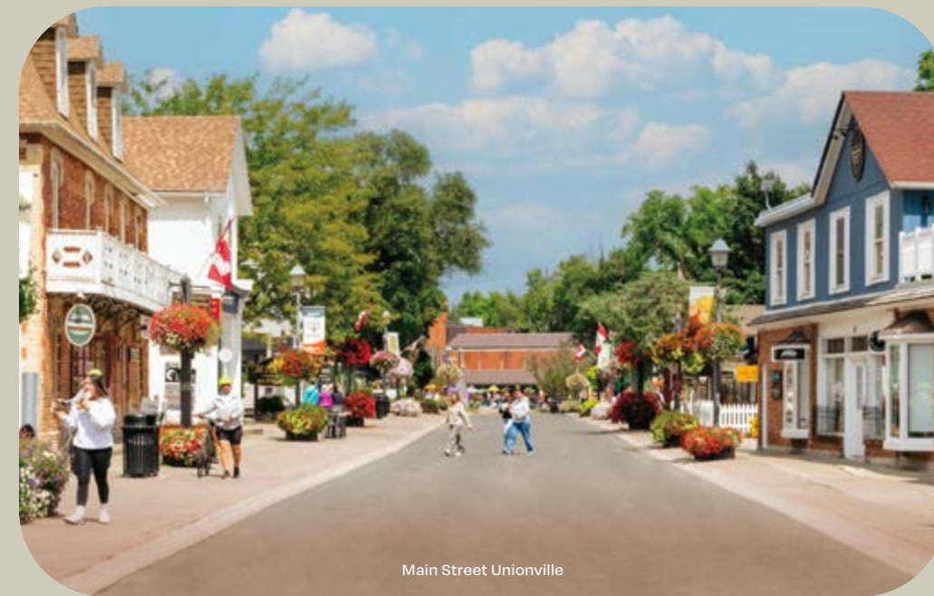
Main Street Unionville