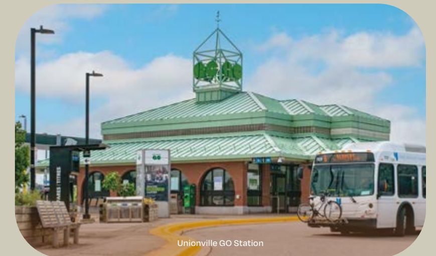
Unionville GO Station