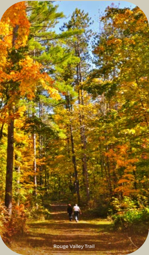
Rouge Valley Trail