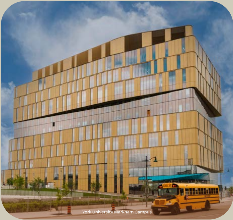
York University Markham Campus