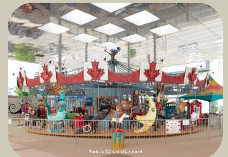
Pride of Canada Carousel