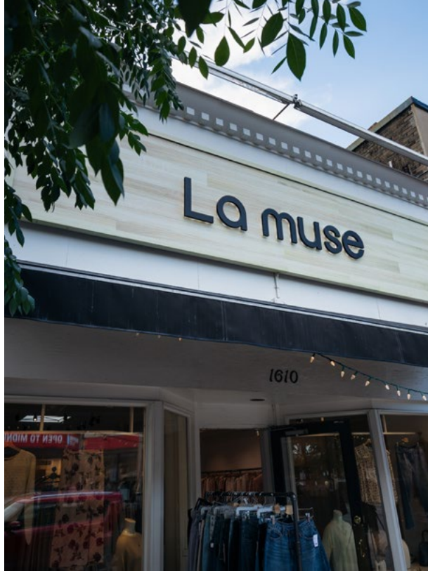
⤴ Shopping in Leaside means having a selection for everything without needing the big box store. You can find everything you need on Bayview.