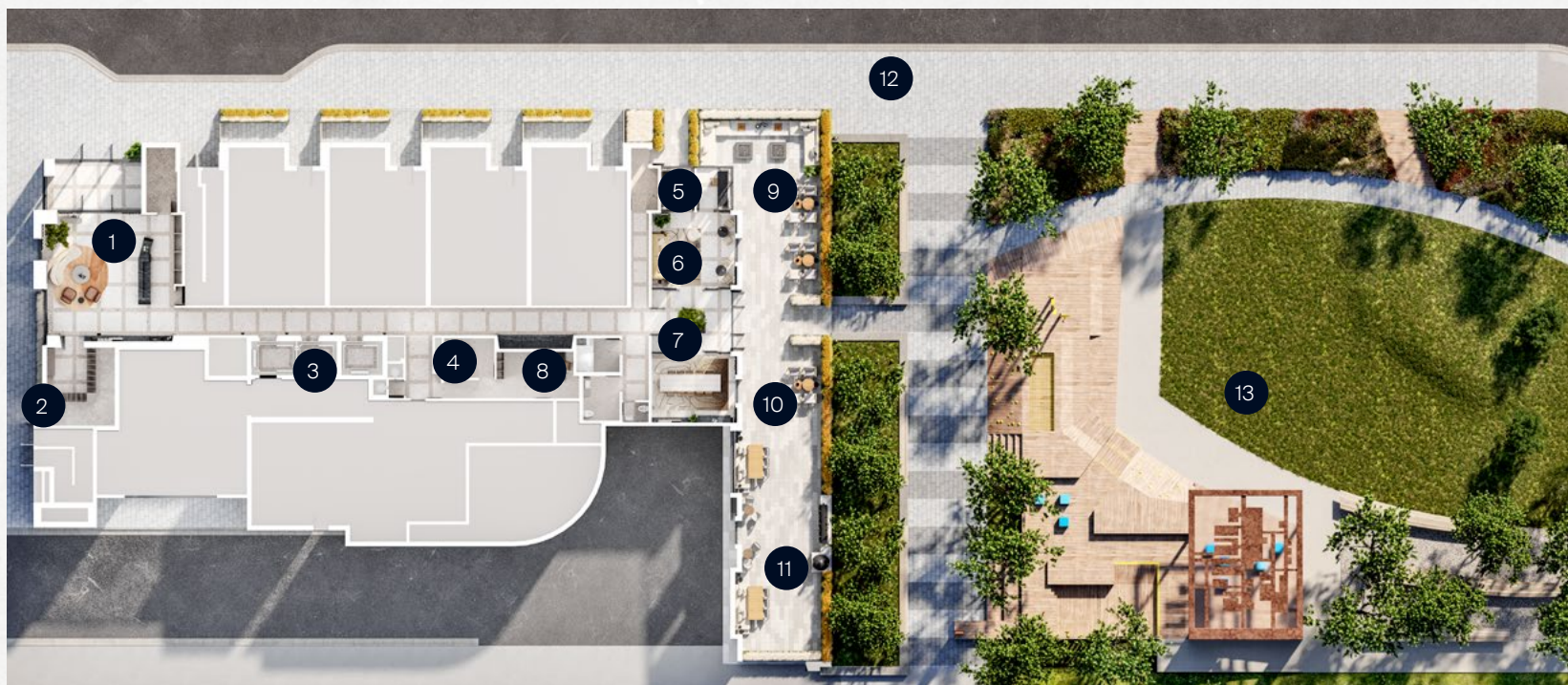
ILLUSTRATION IS ARTIST'S CONCEPT. E. & O.E.