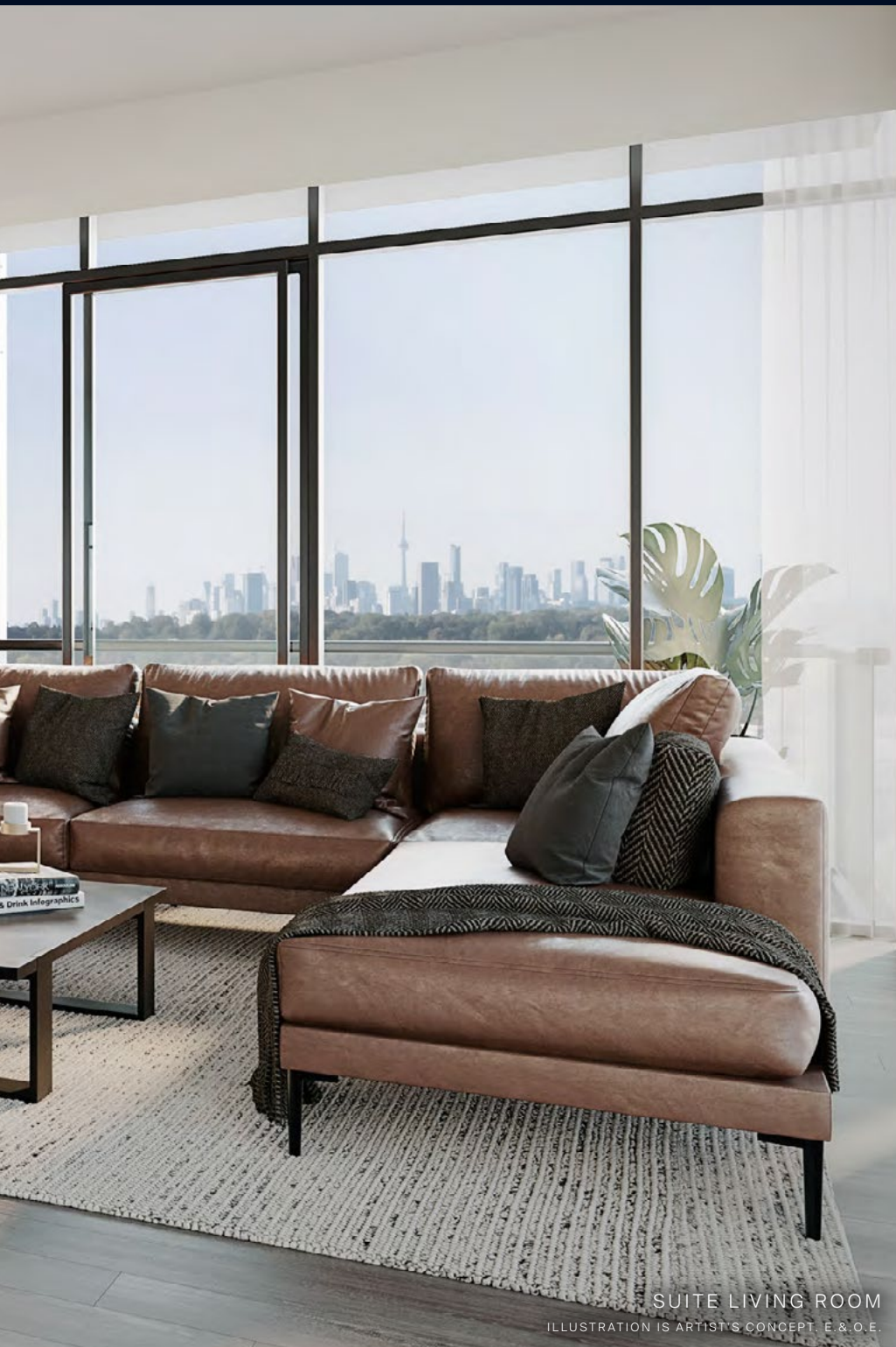
SUITE LIVING ROOM