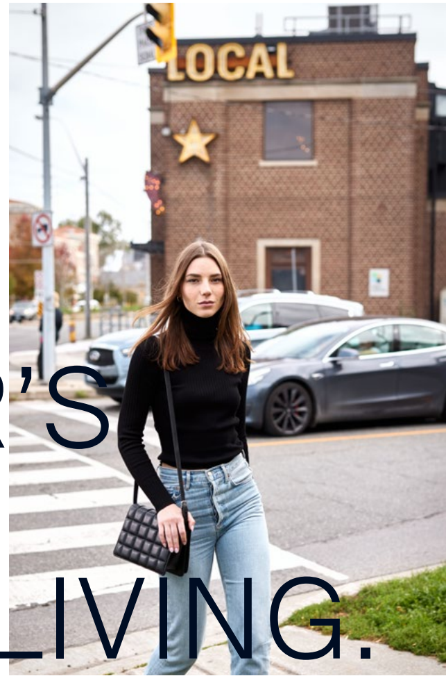
⤵ Make sure you get to happy hour on Laird and try their spicy wings!