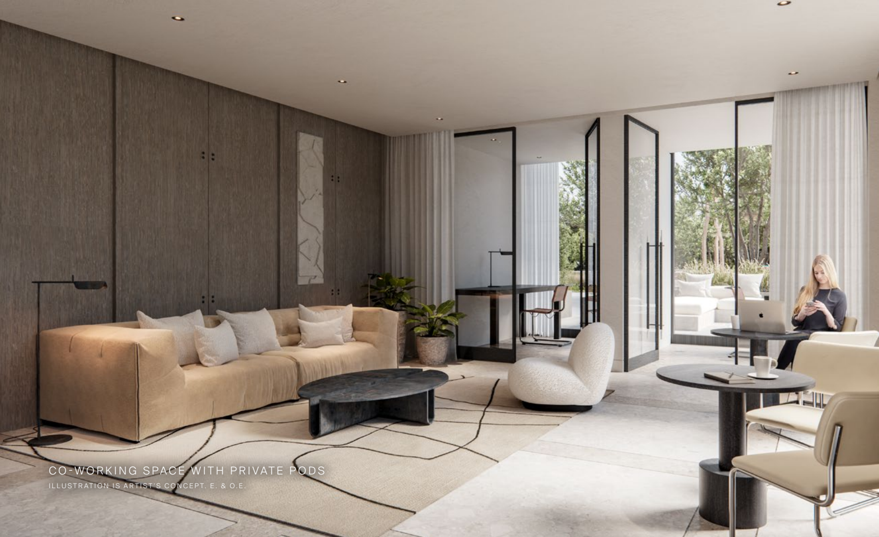
CO-WORKING SPACE WITH PRIVATE PODS ILLUSTRATION IS ARTIST'S CONCEPT. E. & O.E.