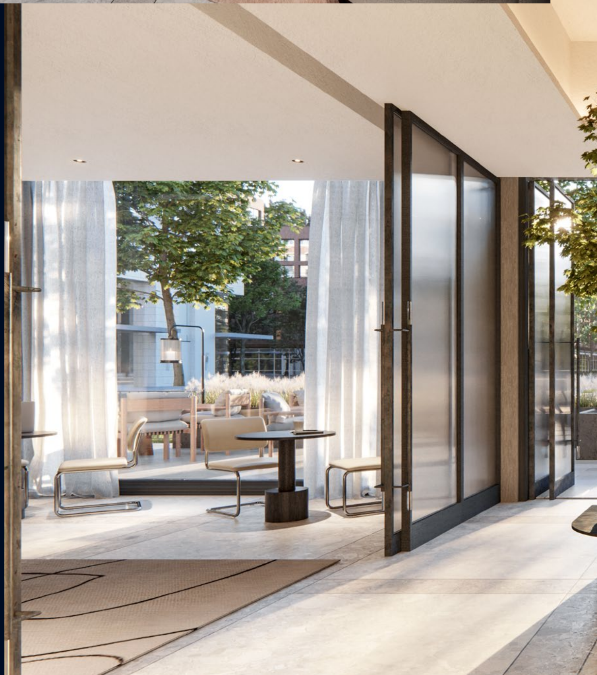
ILLUSTRATION IS ARTIST'S CONCEPT. E. & O.E.