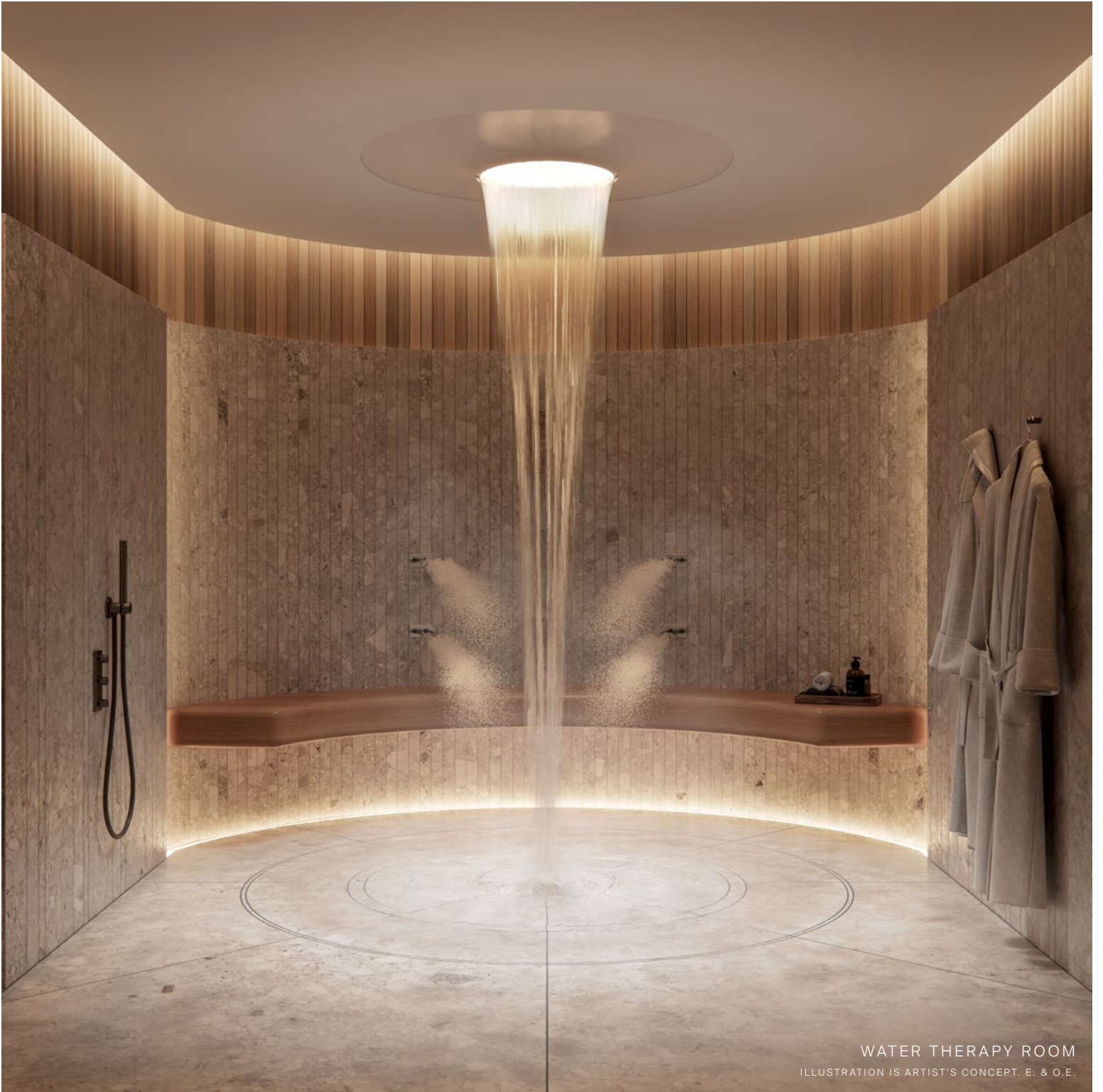
WATER THERAPY ROOM ILLUSTRATION IS ARTIST'S CONCEPT. E. & O.E.