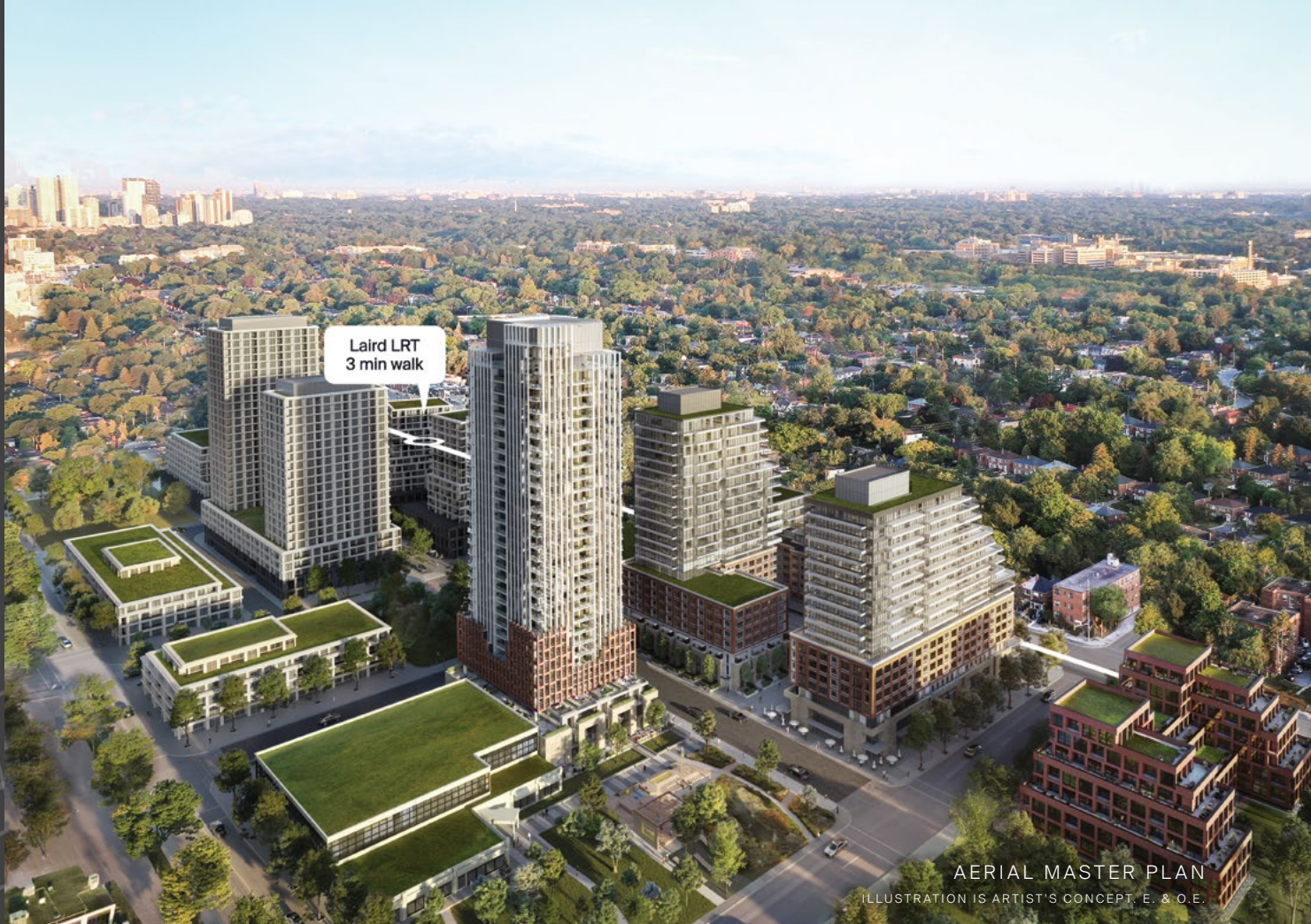
AERIAL MASTER PLAN ILLUSTRATION IS ARTIST'S CONCEPT. E. & O.E.