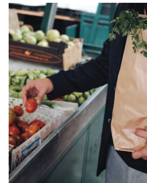
Real Canadian Superstore · 3 Min Walk