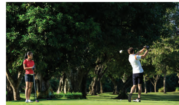
Guildford Golf & Country Club · 5 Min Drive