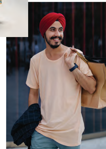
Dollarama · 4 Min Walk