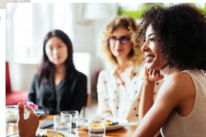
Boston Pizza · 5 Min Walk