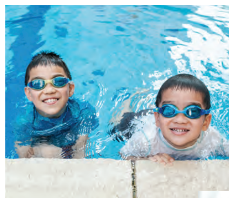
Newton Recreation Centre · 8 Min Walk