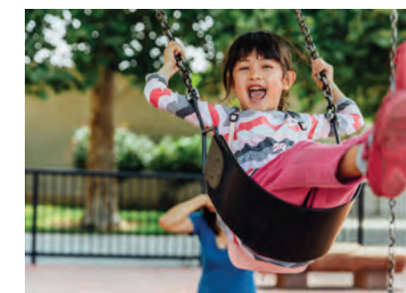
Community Park · 1 Min Walk