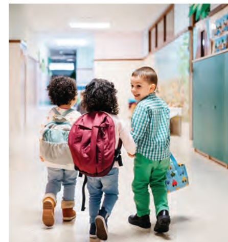
Frank Hurt Secondary · 6 Min Walk