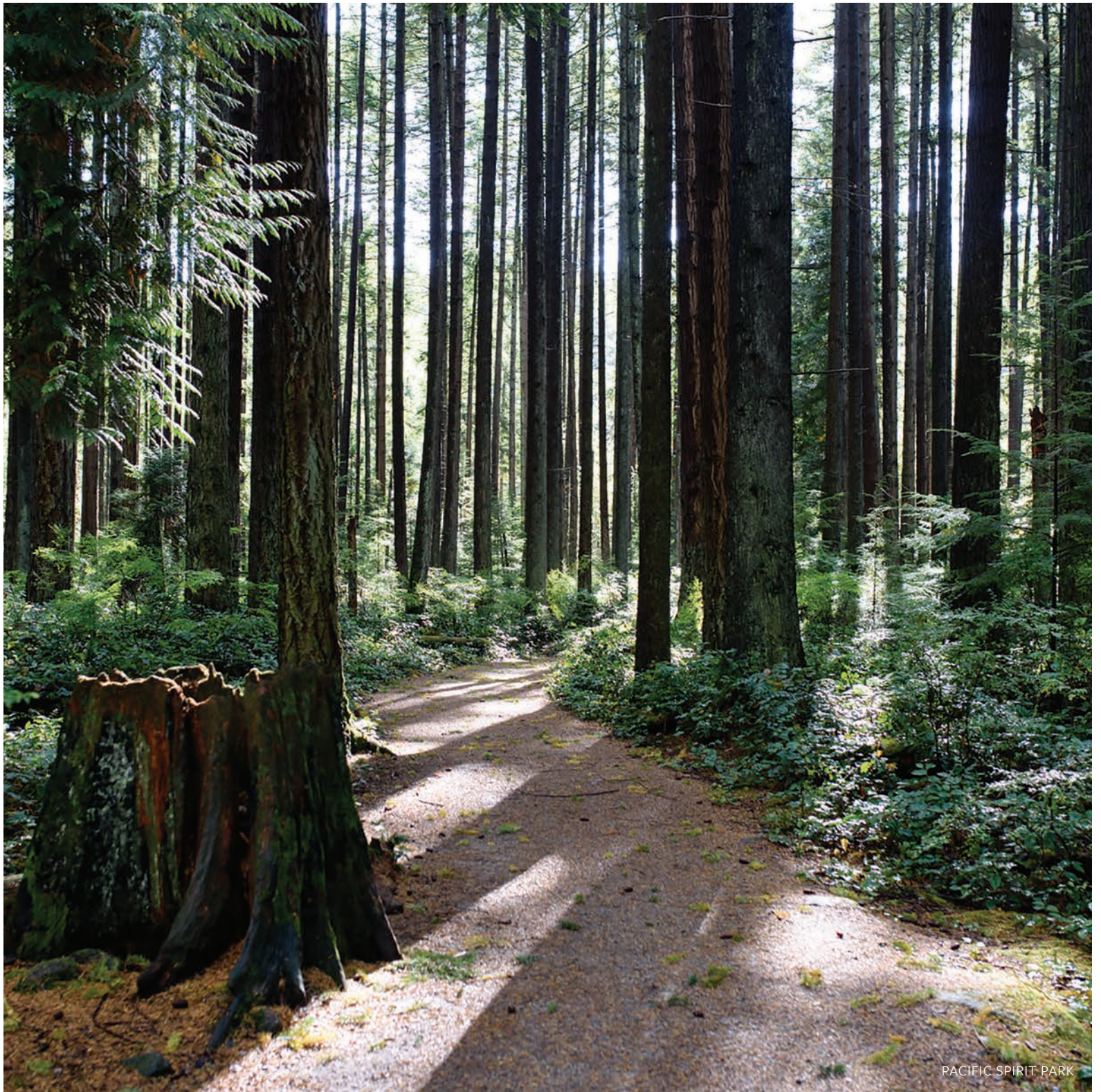
PACIFIC SPIRIT PARK