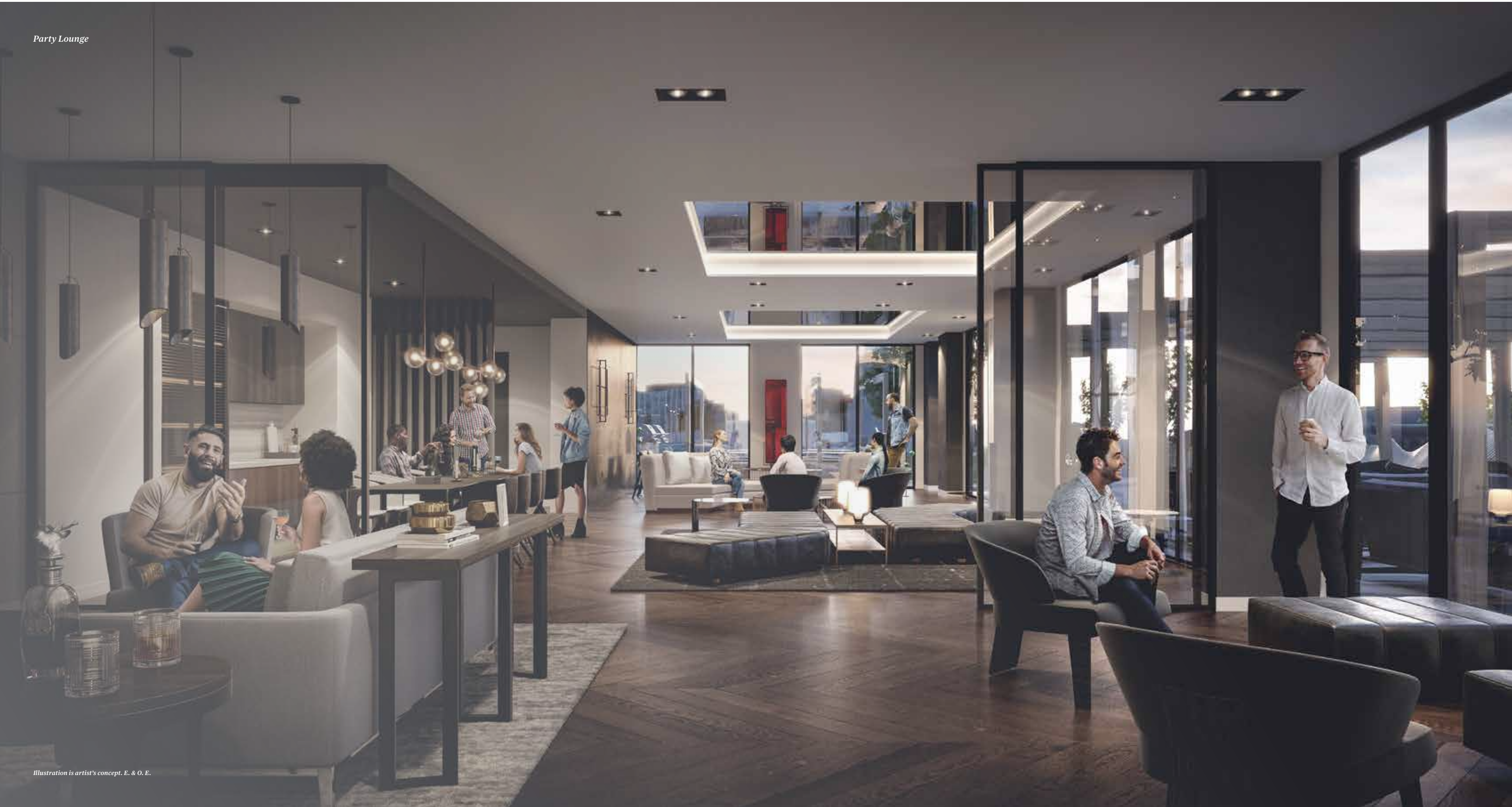
Illustration is artist's concept. E. & O. E.