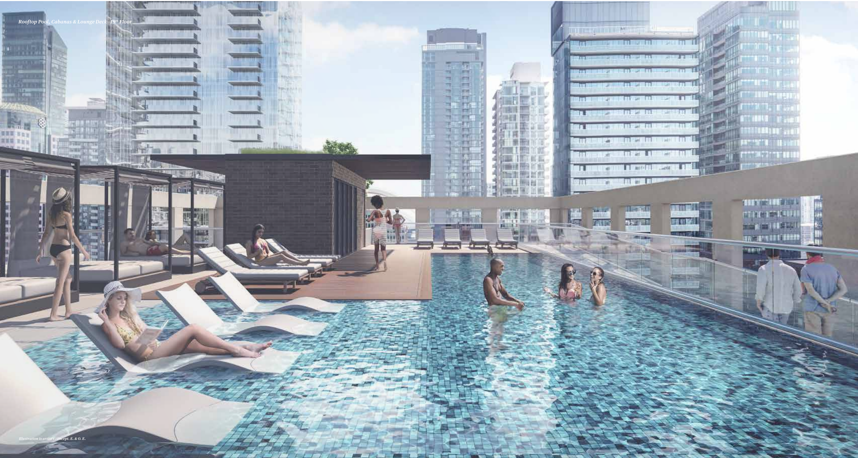
Illustration is artist's concept. E. & O. E.