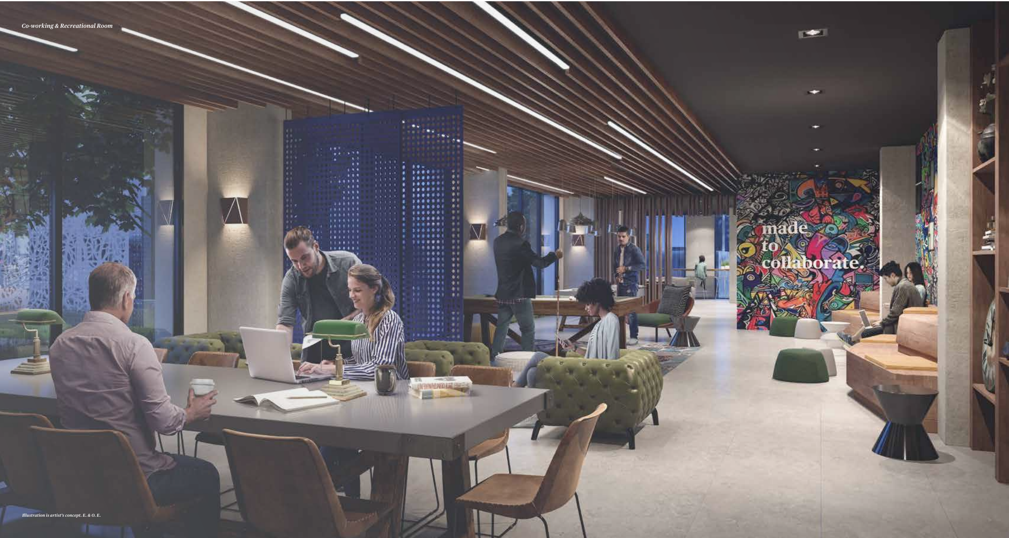
Illustration is artist's concept. E. & O. E.