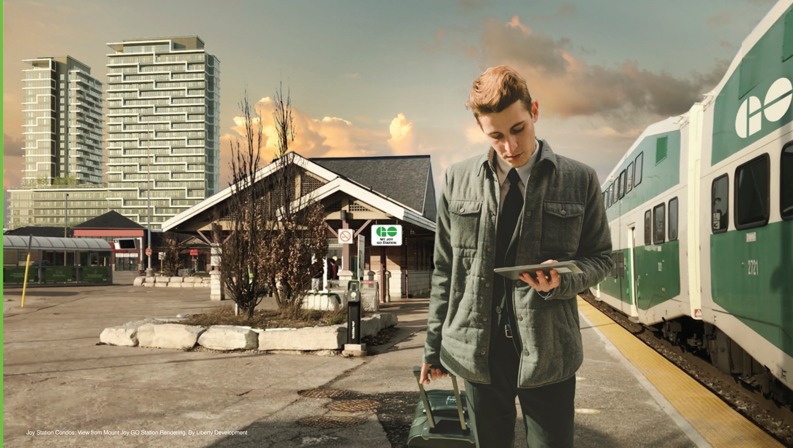
Joy Station Condos: View from Mount Joy GO Station Rendering, By Liberty Development