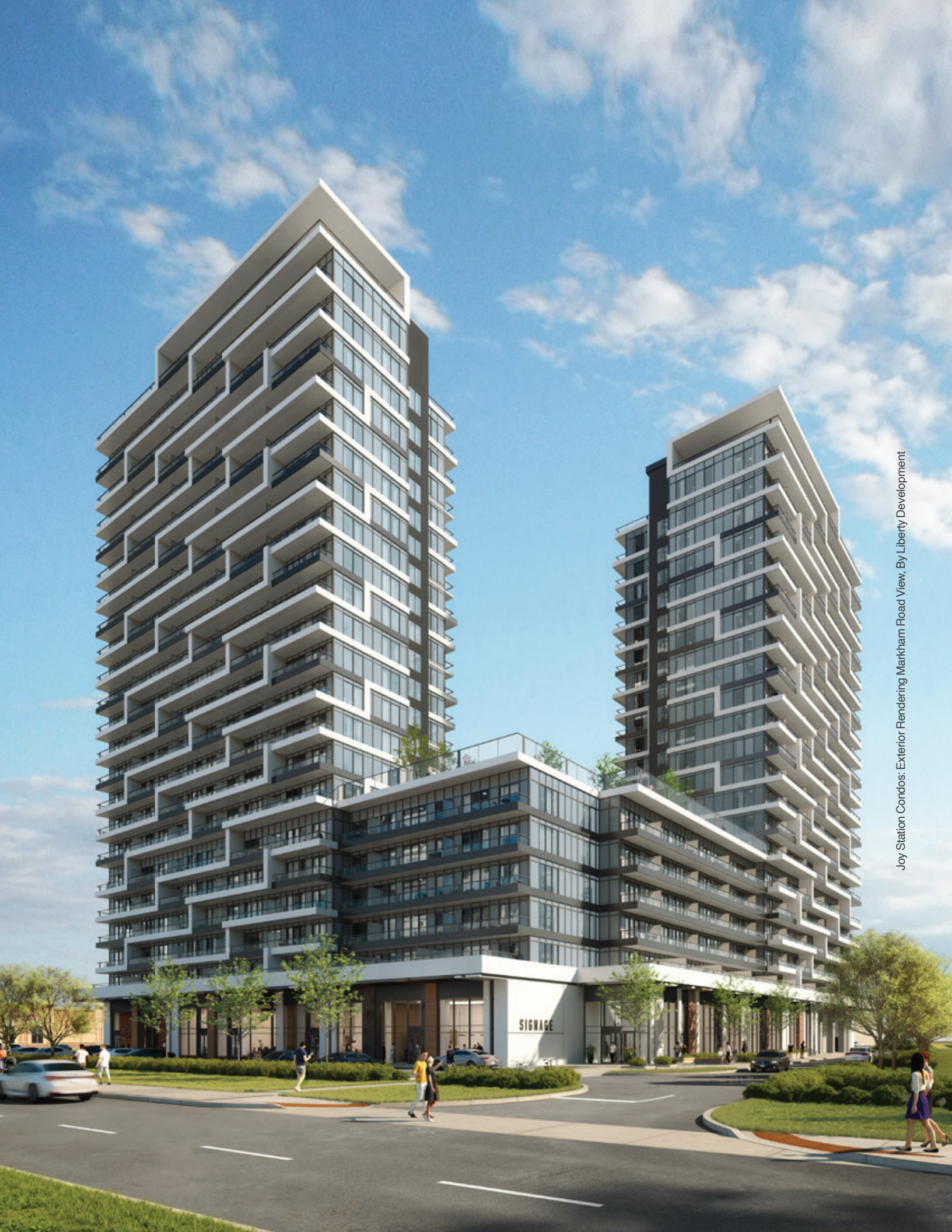
Joy Station Condos: Exterior Rendering Markham Road View, By Liberty Development