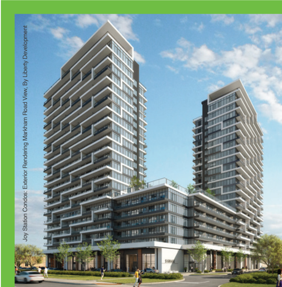
Joy Station Condos: Exterior Rendering Markham Road View, By Liberty Development

Destination – happiness! Experience a complete lifestyle location that’s rooted in small-town charm, yet booming as an urban centre of opportunity. Connected to the core by close proximity to Mt. Joy Go Station, Joy Station Condos invites a family-friendly, diverse community environment with beautiful parks and places to play as well as all the modern amenities you want to lead a quality life.