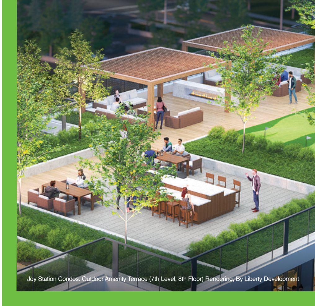
Joy Station Condos: Outdoor Amenity Terrace (7th Level, 8th Floor) Rendering, By Liberty Development