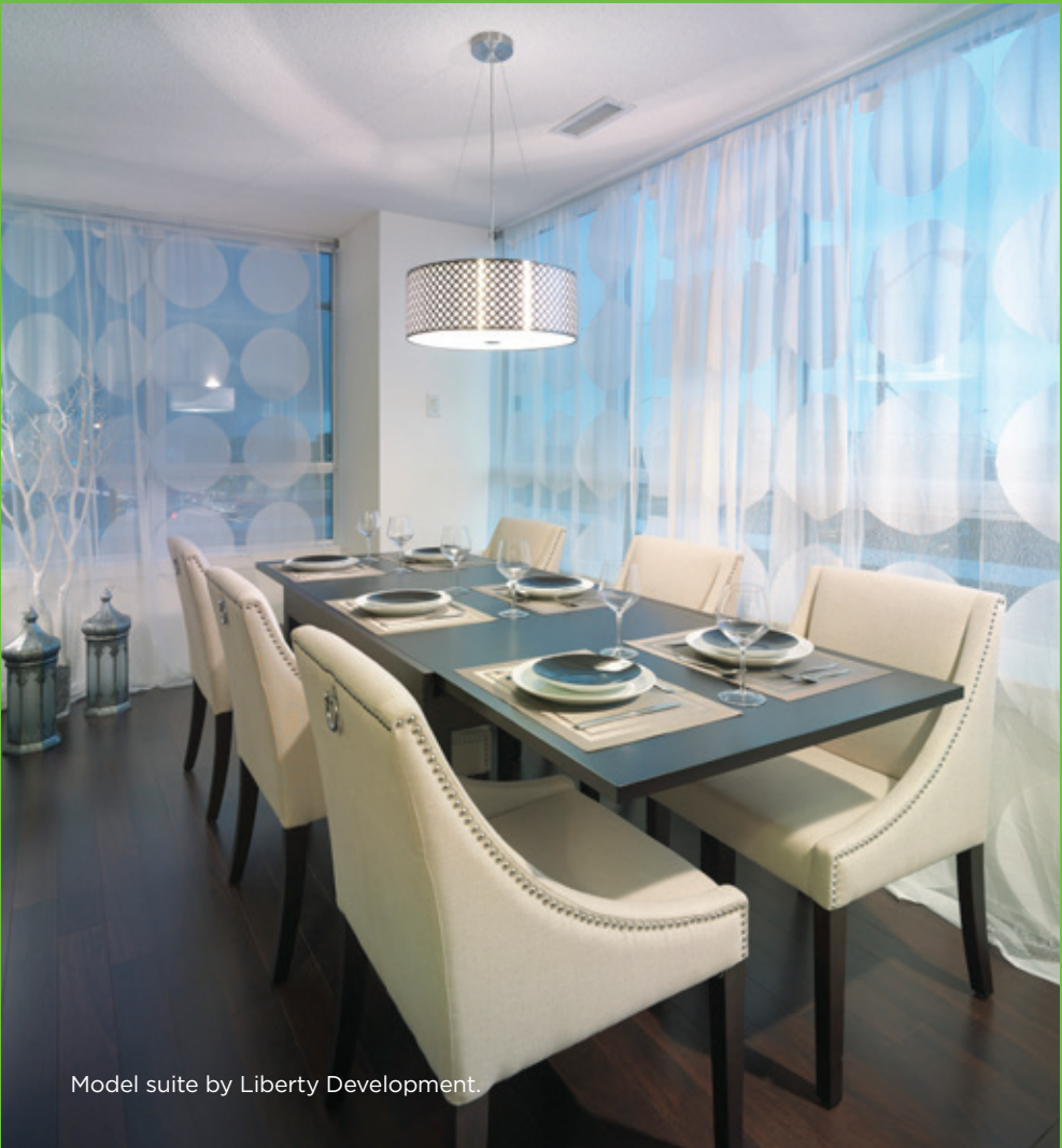
Model suite by Liberty Development.