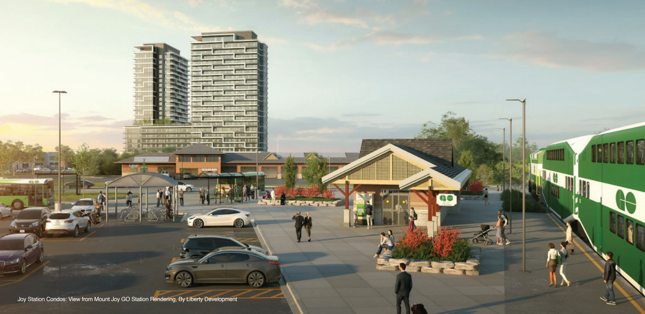
Joy Station Condos: View from Mount Joy GO Station Rendering, By Liberty Development